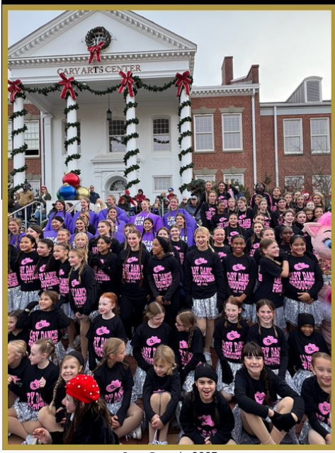
Cary Parade 2025