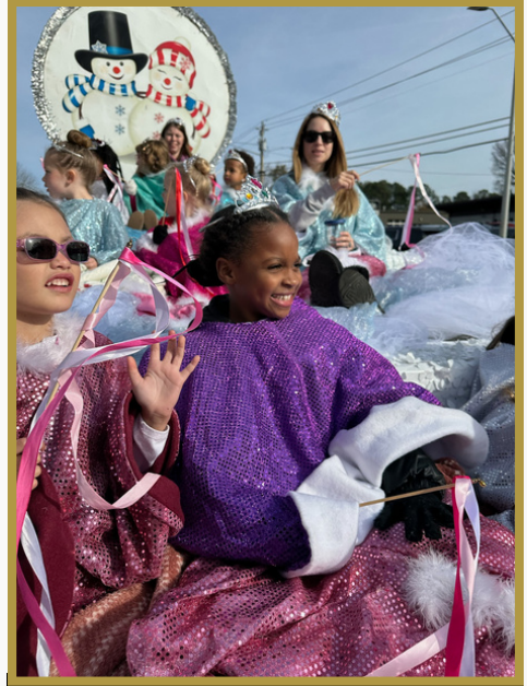
Cary Parade Float Riders!