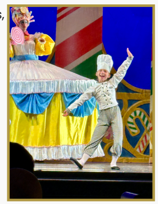
Congratulations to all the cdp ballet superstars who participated in the NUTCRACKER this holiday season!

This year we are collecting GIFT CARDS! It's not too late!! Bring a gift card in for the Carying Place and we will celebrate your family's donation with an ornament on display at our CREATE events.