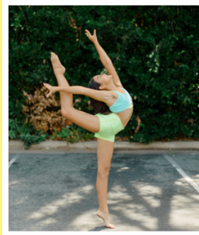
SUMMER INTENSIVE PHOTO SHOOT

AVAILABLE TO INTERMEDIATE-ADVANCED DANCERS AGES 6+ JULY 14TH-18TH 9:30-3:30PM $375